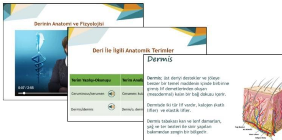
Figure 2. Interactive multimedia content.

In the first week of the semester, learners were introduced to the flipped classroom model and how it would work for their course. Since learners were familiar with the traditional instructional methods, a level of resistance to this new model was observed in the initial weeks of the course. In order to deal with this resistance, online discussion forums were held and students received feedback every week. In addition, participation in virtual classes and asynchronous activities were evaluated and bonus points awarded by the lecturer.